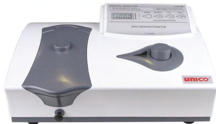
S1200 shown with Cuvet Holder closed