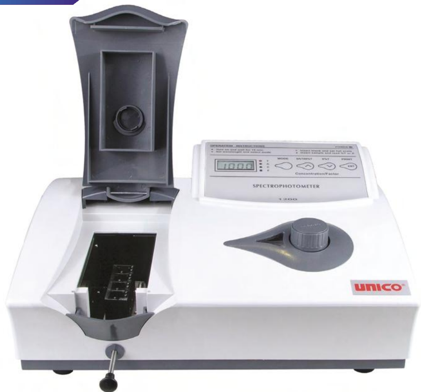
S1200's 50mm pathlength sample chamber accepts a wide variety of cells and accessories